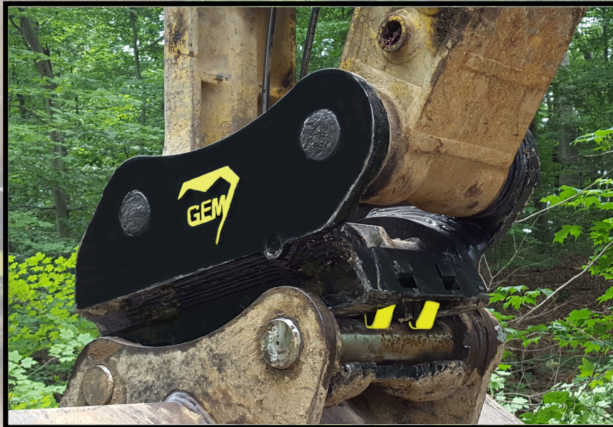
Secondary Rear Lock Visible From Cab When In Lock Position